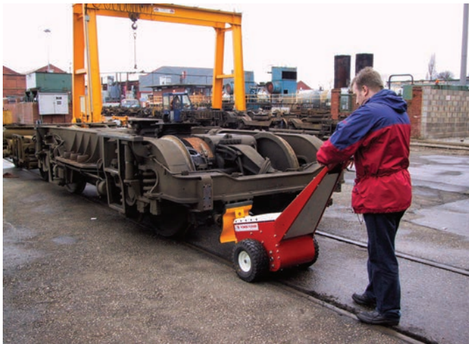
Push Pad Attachment