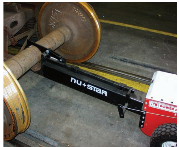
Rail Car Attachment