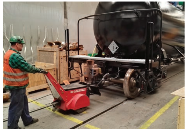
Push Pad Attachment